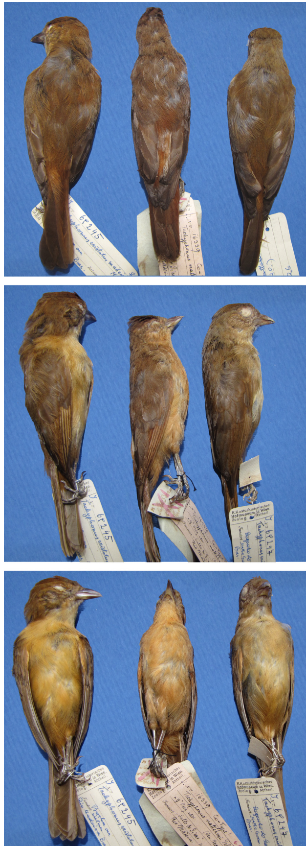
FIGURE 6. Comparison between the female of Tachyphonus nattereri (in the center, NMW 16339—Salto do Jirau, Rondônia, Brazil) and two females of T. cristatus madeirae (left, NMW 69245—Borba, Rio Madeira, Amazonas, Brazil; right NMW 69247—Engenho do Gama, Mato Grosso, Brazil).