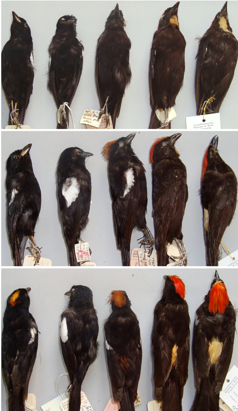
FIGURE 4. From left to right, males of Tachyphonus luctuosus nitidissimus (NMW 2832—Bugaba, Chiriquí, Panamá), Tachyphonus l. luctuosus (NMW 69215—Villa Maria [= Cáceres], Mato Grosso, Brazil), Tachyphonus nattereri (Holotype, NMW 16338—Villa Maria [= Cáceres], Mato Grosso, Brazil), Tachyphonus cristatus madeirae (NMW 69243—Borba, Rio Madeira, Amazonas, Brazil), and Tachyphonus c. brunneus (NMW 86987—“Bahia”, Brazil).