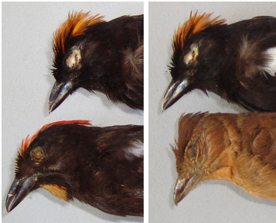
FIGURE 3. Comparison between the bill shape of the holotype of Tachyphonus nattereri (above in both pictures; NMW 16338—Villa Maria [= Cáceres], Mato Grosso, Brazil) and a male T. c. madeirae (below, left; NMW 69243—Borba, Rio Madeira, Amazonas, Brazil) and the purported female of T. nattereri (below, right; NMW 16339—Salto do Jirau, Rondônia, Brazil).