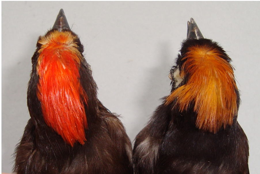
FIGURE 2. Comparison between the crest of T. c. madeirae (left; NMW 69243—Borba, Rio Madeira, Amazonas, Brazil) and the holotype of T. nattereri (right, NMW 16338—Villa Maria [= Cáceres], Mato Grosso, Brazil). Note the holotype’s shorter and yellower crest feathers.

Bill shape is also distinct between T. nattereri and T. c. madeirae . The holotype of T. nattereri has a somewhat slender bill with attenuated tip of the maxilla compared to the more robust and “toothed” bill of T. cristatus (and of the purported female; Figure 3).