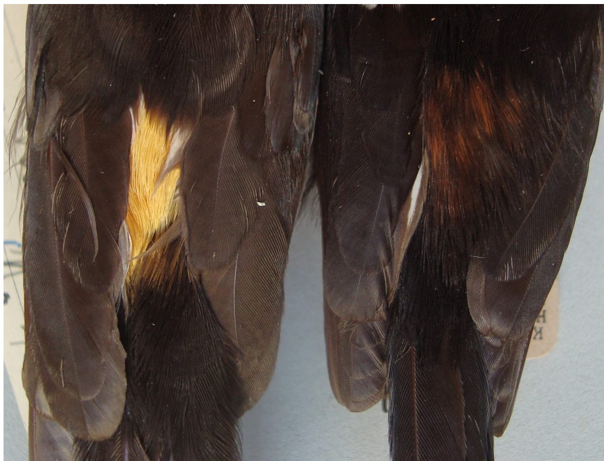
FIGURE 5. Comparison of the rump patch between T. c. madeirae (left; NMW 69243—Borba, Rio Madeira, Amazonas, Brazil) and the holotype of T. nattereri (right, NMW 16338—Villa Maria [= Cáceres], Mato Grosso, Brazil).

The holotype of T. nattereri further differs from T. c. madeirae by the darker and more restricted rump patch, approaching the features exhibited by T. l. luctuosus , which has no rump patch. In fact, in the holotype of T. nattereri the rump patch is reduced, irregularly shaped and with diluted colors (especially on its borders; Figure 5).