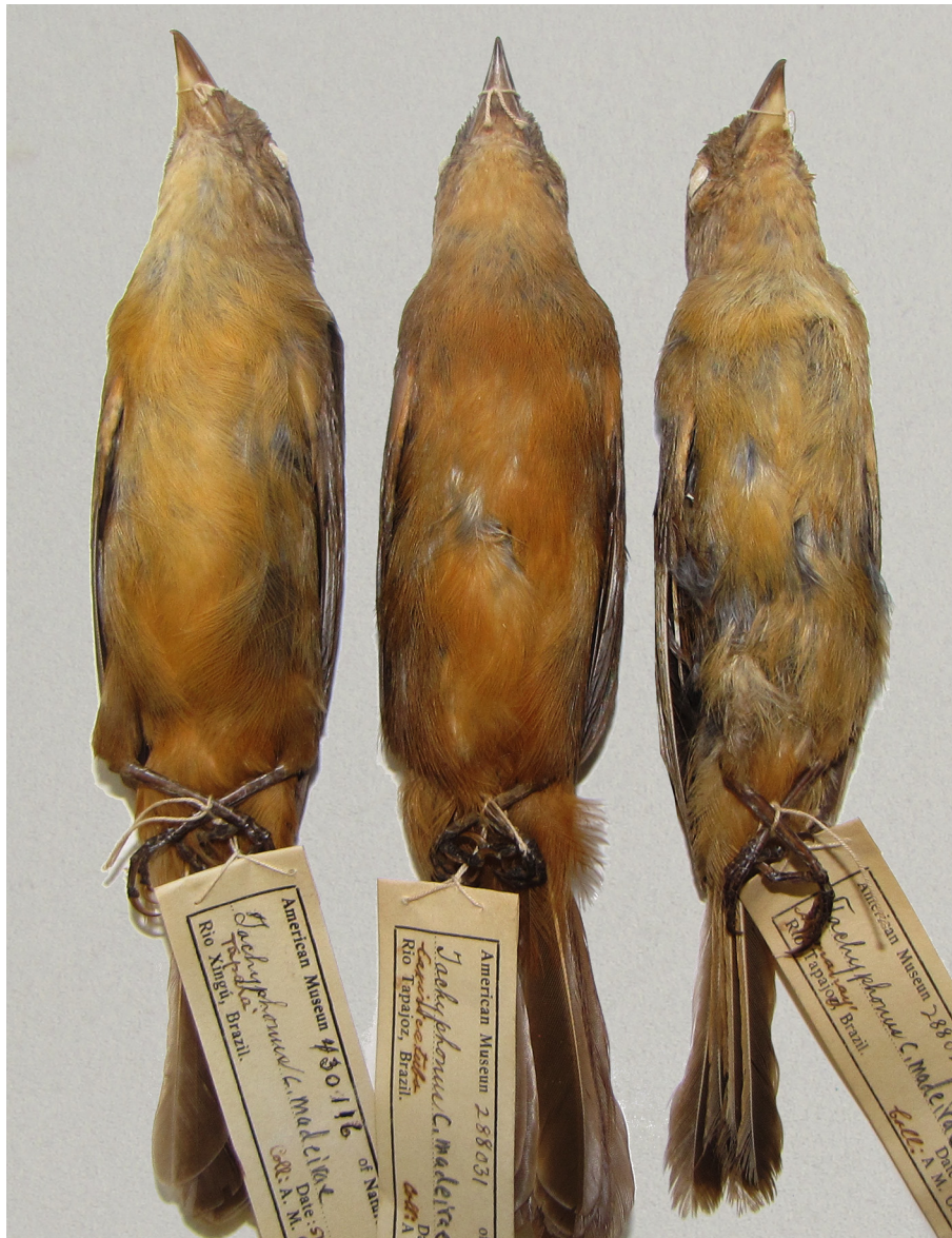
FIGURE 7. Chromatic variation exhibited by females of Tachyphonus cristatus madeirae collected in the state of Pará, Brazil. From left to right, AMNH 430116—Tapará, Rio Xingu; AMNH 288031—Caxiricatuba, Rio Tapajós, and AMNH 288025—Aramaná, Rio Tapajós.

The purported female of T. nattereri differs from the few females of T. c. madeirae collected by Natterer and housed in the NMW in being somewhat more rufescent (Figure 6). Nevertheless, analysis of a large series of females housed in AMNH and MZUSP revealed large chromatic variation in this subspecies, with some approaching the color of the purported female of T. nattereri (Figure 7).