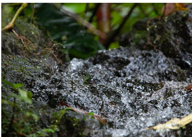
Fig. 4 Empress brilliant (female) bathing in flowing water of a waterfall in Mashpi, Ecuador, 15 June 2011.