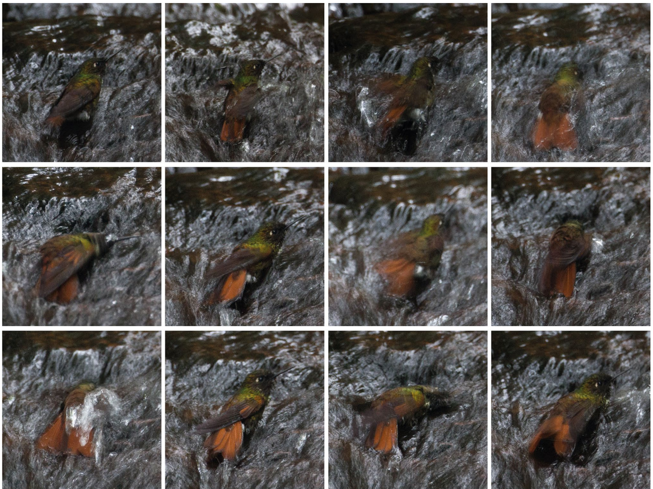
Fig. 3 Sequence of the Brazilian ruby bath at Cachoeira Raio de Sol (first part).